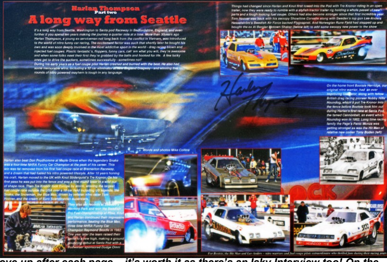
The Budweiser years' DRO issue is back-to-front - just scroll to the bottom move up after each page – it's worth it as there's an Isky Interview too! On the next page big-buck serendipity leads to a clip that ran all weekend on BBCTV 'cos they loved it, but not as much as Budweiser - check it out and see why!