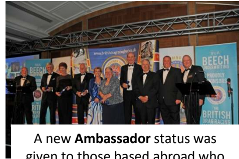
A new Ambassador status was given to those based abroad who have helped promotion of the BDRHoF